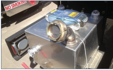
Truck mounted disposal/holding tank