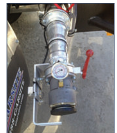
Single-Point Recirculation Valve

Hoses with single point nozzles in fixed or mobile fueling systems that are set up for recirculation should follow EI 1540 recommendations for new hose commissioning and be flushed with 500 gallons of fuel.